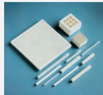
CRYSTAL IMAGING ARRAYS